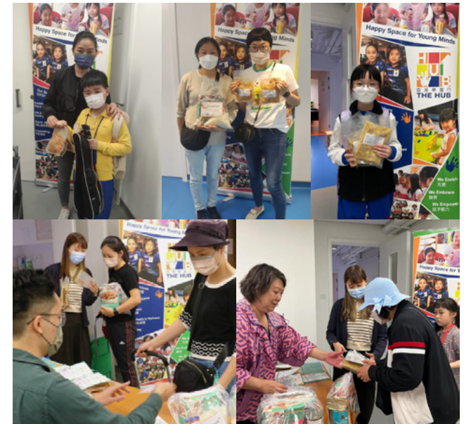
Left: On-site cooking by the Four Seasons culinary team @Ronald McDonald House Kwun Tong; Above: Nutritious food packs program for beneficiaries of The Hub.

Together with The Hub and the Permira Foundation, we undertook a six-week programme to distribute staple food to underprivileged families.