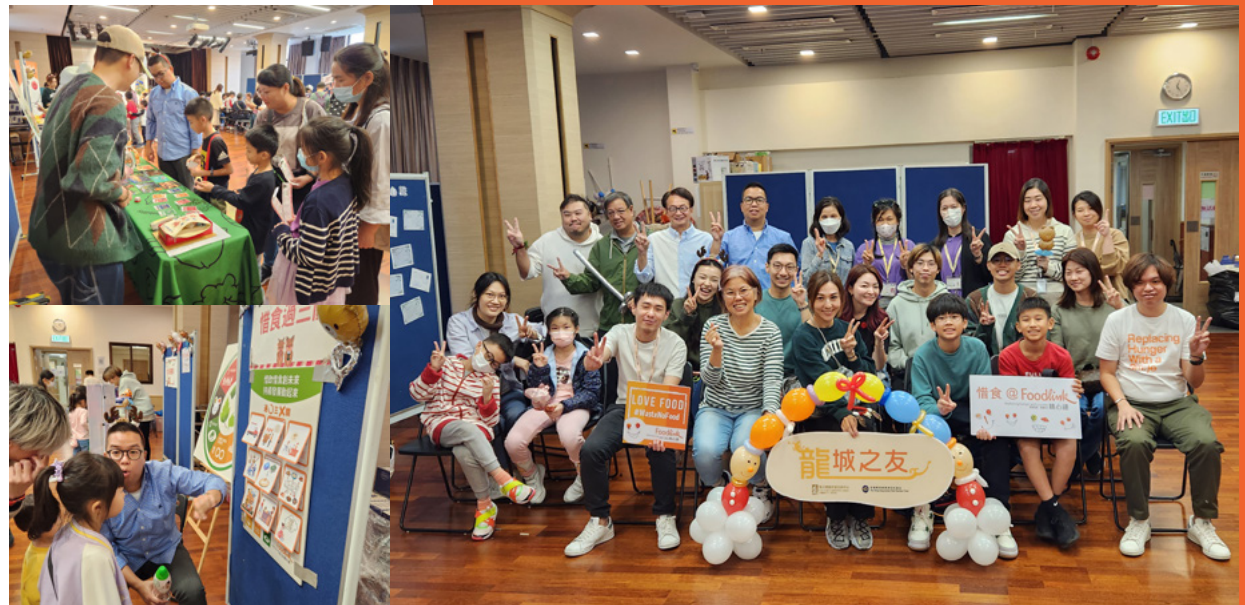
Above: Mid-Autumn Party organized by yuu at Chai Wan Baptist Church Social Service; Top Right: Birthday Party with 55 children of Aldrich Bay Integrated Children & Youth Services; Bottom Right: Christmas Children Bazaar @HKSCH Holy Carpenter Church.