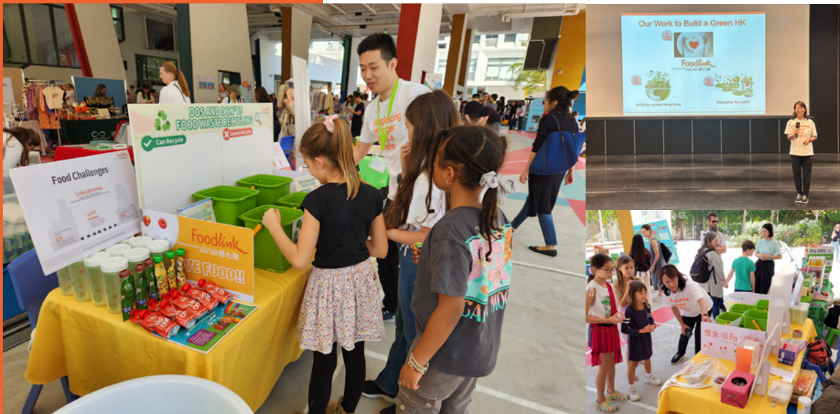
Top: Sustainability Workshop @HSBC; Bottom: Sustainable Fun Day @French International School.

To help make food sustainability more fun for kids, we joined the French International School's Sustainable Fun Day. Our game booth was a fun way for kids to learn about sustainability and food waste.