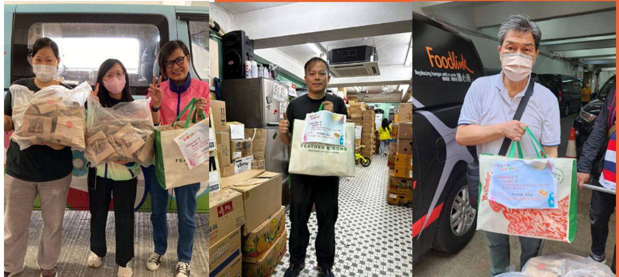
Above: Food pack donations from Permira Foundation; Top/Bottom Right: Festive Easter Cross Buns donations from HK Adventist Hospital Tsuen Wan.