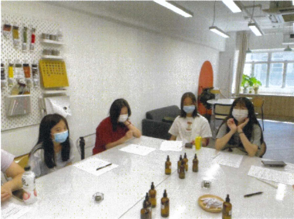
Others - Perfumer Class