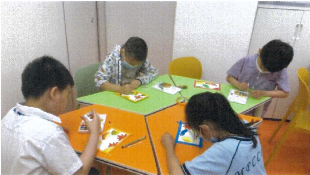
Art - Drawing