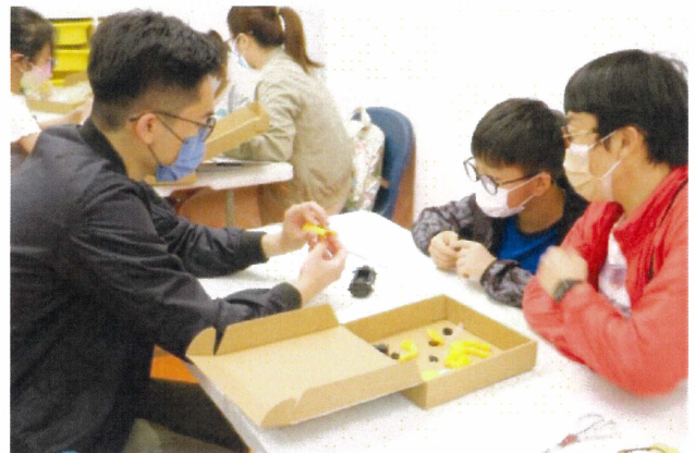
Stem - Electronic Mechanical Dog