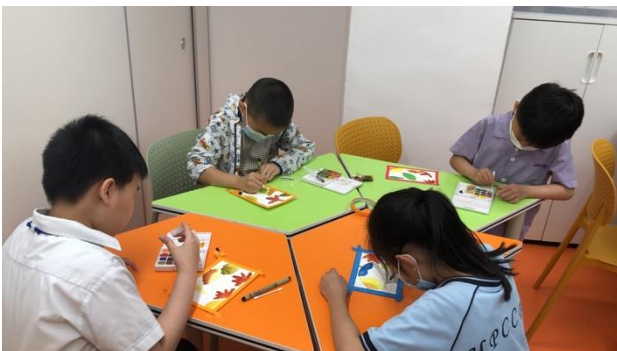
Distributing Anti-epidemic supplies