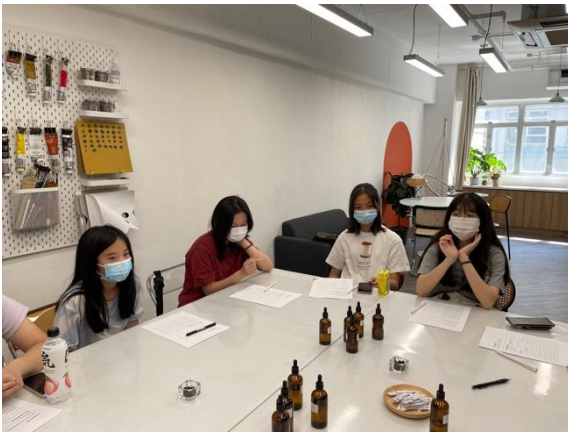
Art - Drawing