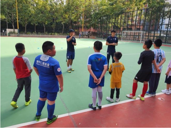
Others - Perfumer Class