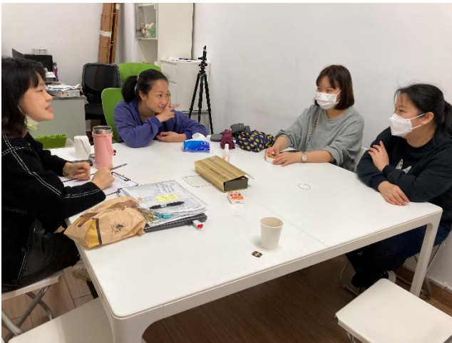
「劏房媽媽」互助小組 Mutual help group for mothers in SDUs