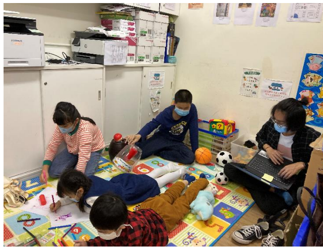
親子悠閒閣 Parent-child relax pavilion