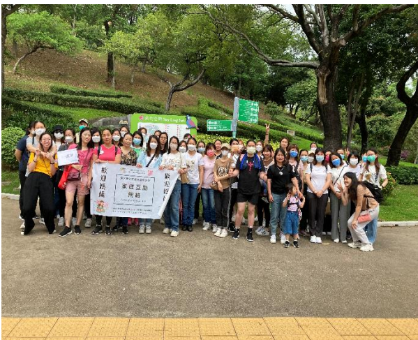
戶外家庭活動 Outdoor family activities