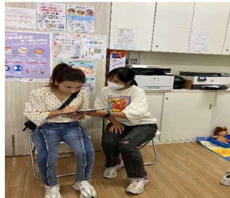
朋輩輔導互助支援服務 Peer counselling mutual support service